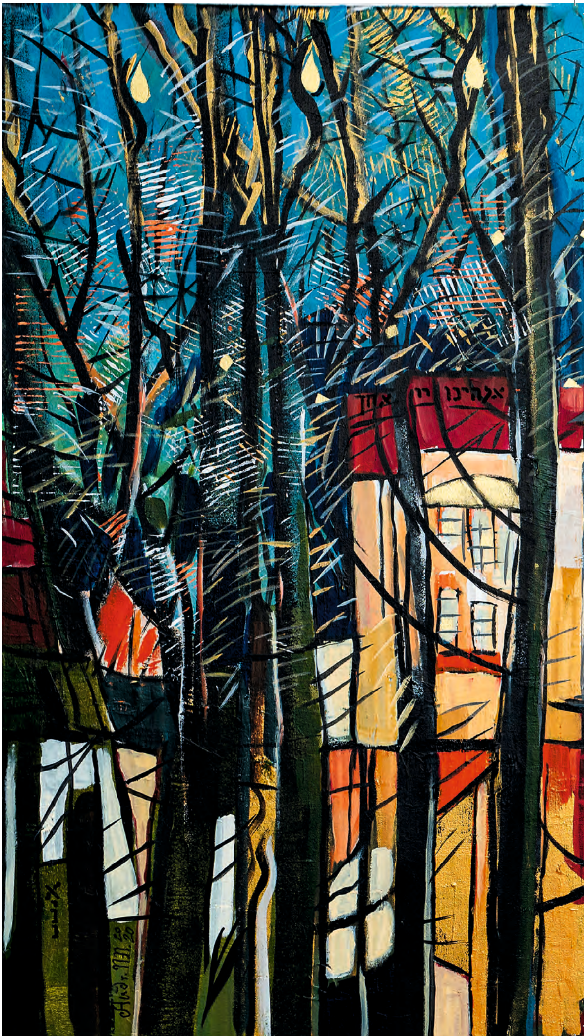
Synagogue , 2021 Andreas (Isak) Neumann-Nochten 150 x 100 cm Acrylic on canvas