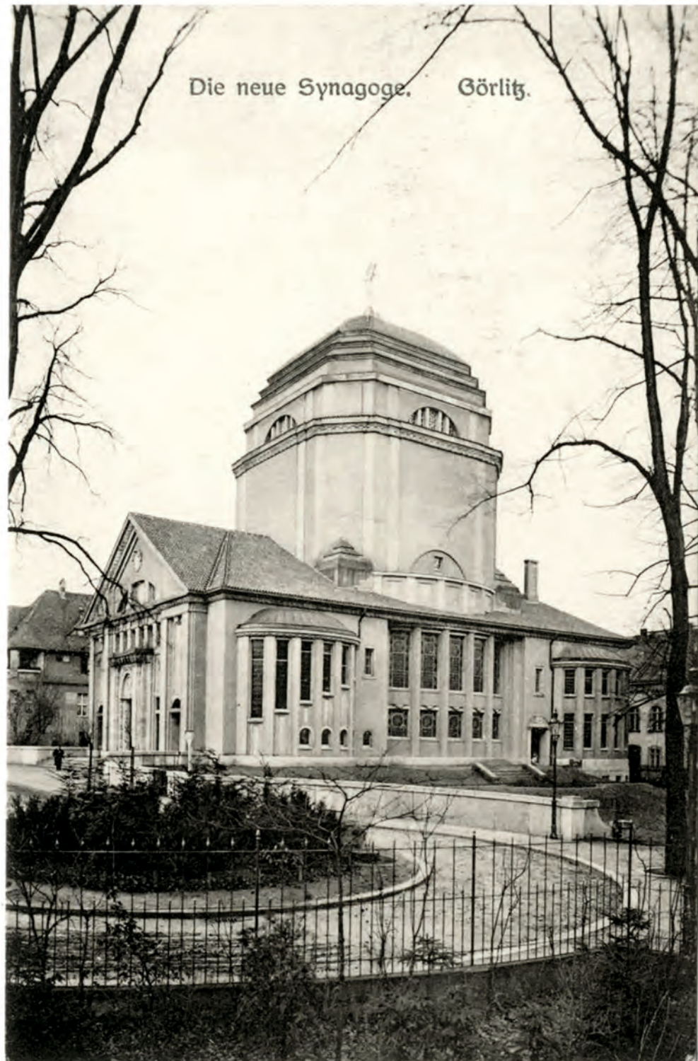
Postcard Görlitz Synagogue, circa 1912